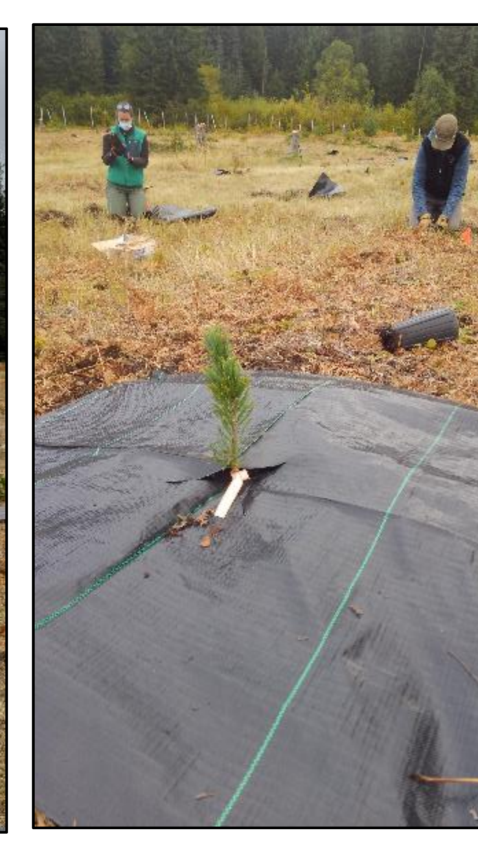
Figure 3. French Butte seed orchard on the Gifford Pinchot NF, Cowlitz Valley Ranger District. Mulch mats were used to reduce competition from grass and to retain soil moisture