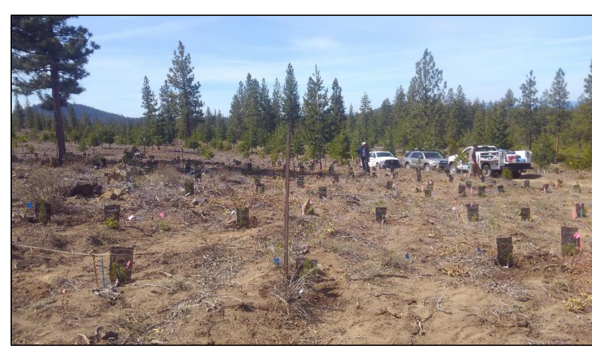
Figure 4. Hazy seed orchard on the Deschutes NF, Bend-Fort Rock Ranger District. A lack of grass and forb competition meant no mulch mats were needed, but a drip irrigation system was installed to provide water throughout the summer