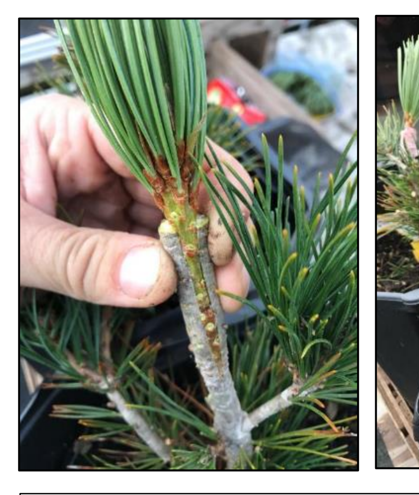
Figure 2. Matching scion to rootstock (left) and a completed graft (right)